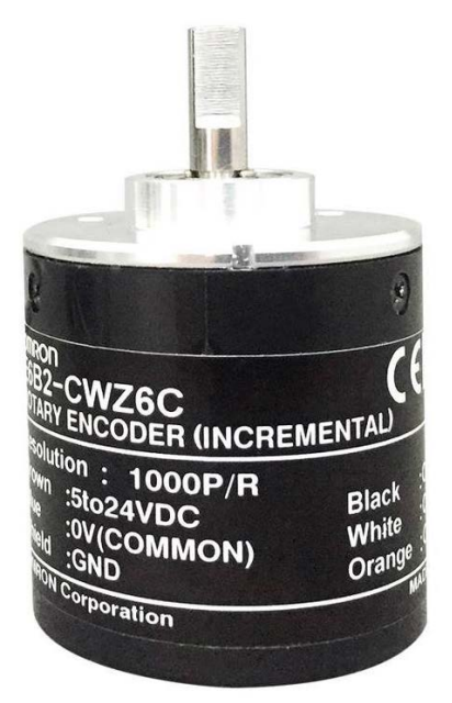
Figure 2. Incremental rotary encoder

can continuously output the number of pulses corresponding to the rotation angle, but it does not output at rest, so long as the pulse part is counted, the rotation position can be known. The incremental rotary encoder can choose the reference position, which can be adjusted according to the Z-phase signal which is only output once in one circle. The sensor 1 is shown in fig. 2.